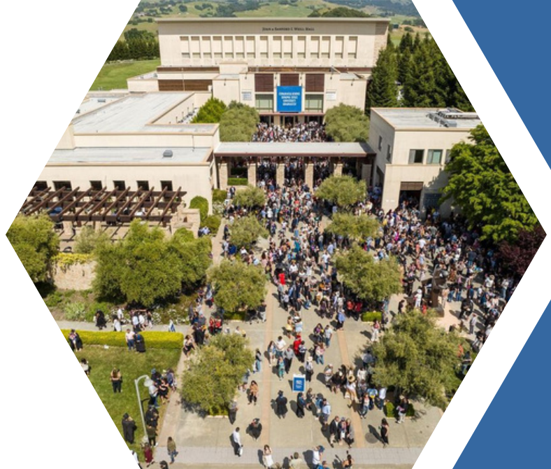
Attendance, Fall 2022 - Spring 2023

During the past Academic Year (August, 2022 to May, 2023) the SSU Staff Council continued to meet every other Tuesday from 1-2pm, with additional ("special") meetings as needed. Attendance has continued to increase as compared to previous years. Looking forward, we hope to maintain or grow our current attendance numbers.